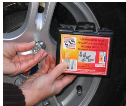
Locking Wheel Bolts