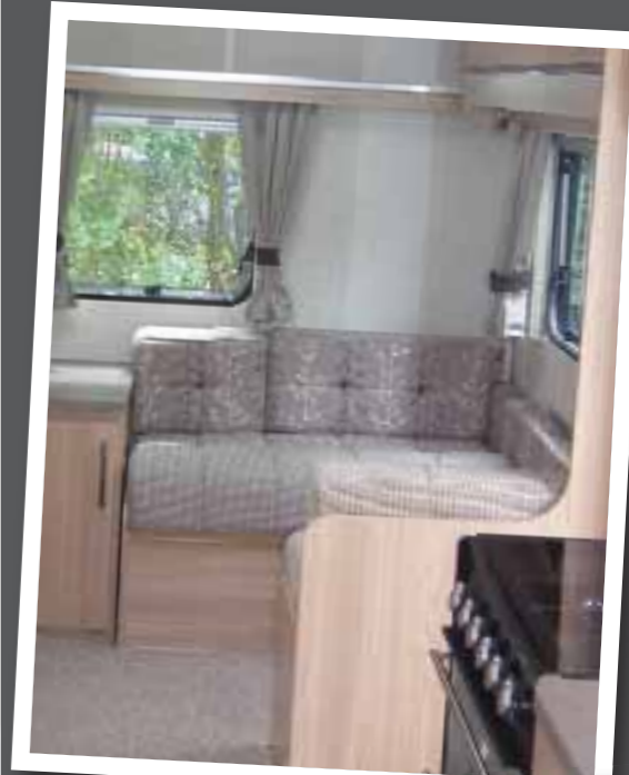
Above: kids get their own rear seating area...

As a result, this room is definitely at its best when being used to accommodate >>