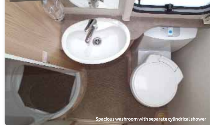
Spacious washroom with separate cylindrical shower

"...beautiful finishing and fine attention to detail throughout"