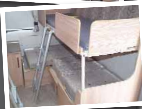
Right... which at night can magically turn into a pair of bunks if needed