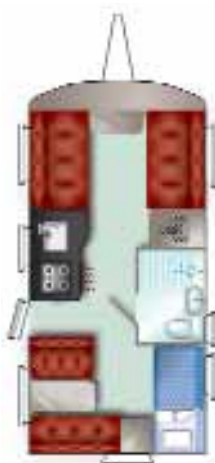
Right: fixed rear bunks measure in at 5ft 9in x 2ft each

two (or perhaps three – making up the lower-level bed alone would not be quite such a chore). The seats themselves exhibit the same welcome comfort as those at the front, although the backrests are slightly shorter.